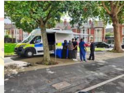
End of week Talk to Us event