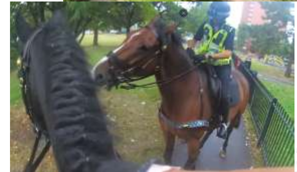
Body Cam of shoplifter arrest Rawnsley Park