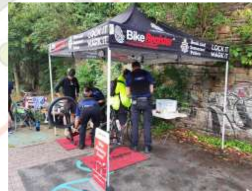
Bike Marking Event