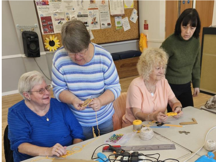
Image 2: Community group at The Rock Centre, who received a CRF grant

approach to ensure access improvements were produced to a high standard, following best practice and taking a range of access needs into account.