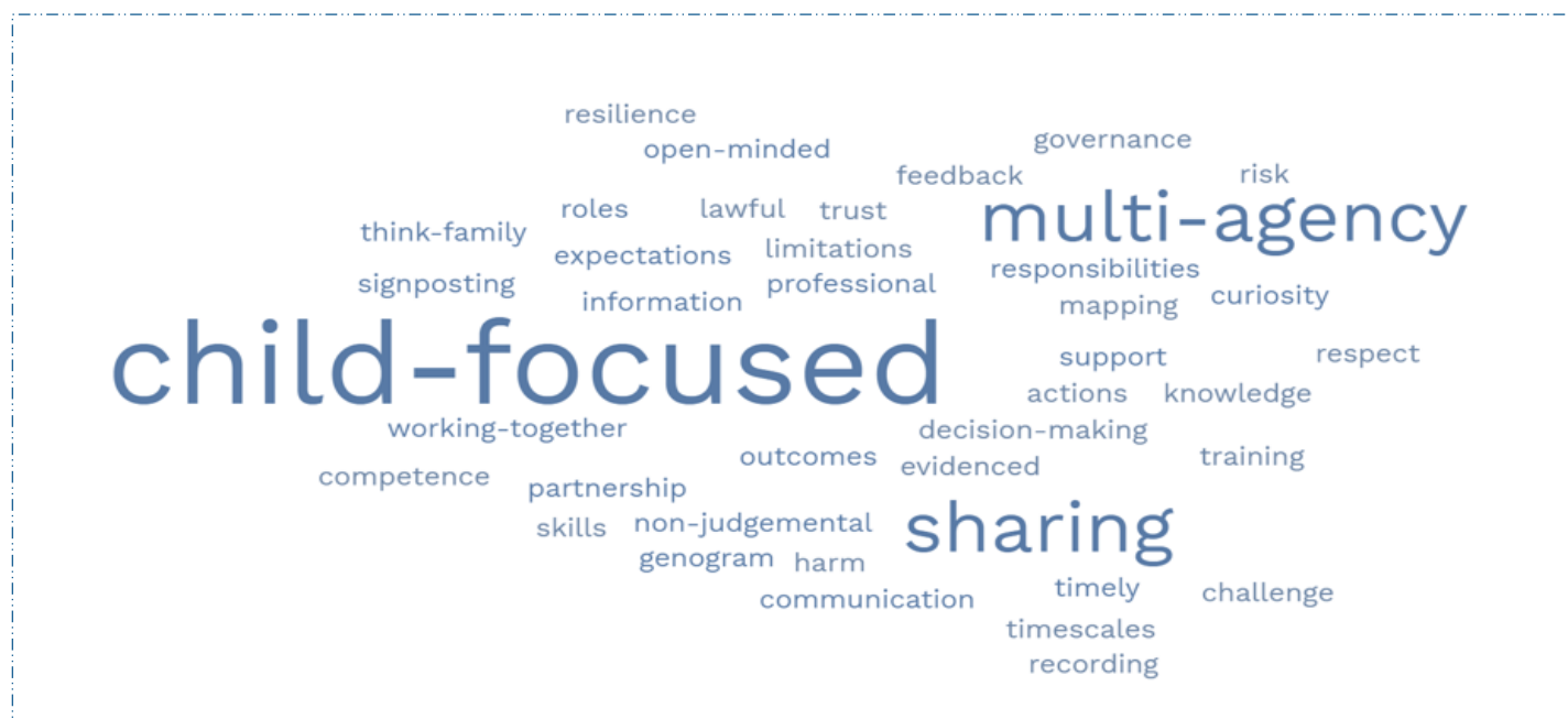
Figure 2: Word storm of key features of a good quality child protection investigation